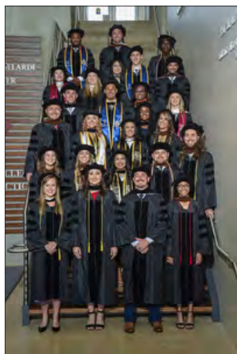
June 2021 Sherman College graduates.