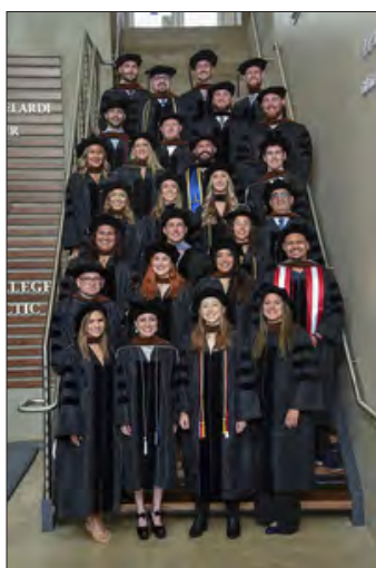
September 2021 Sherman College graduates